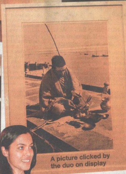
A picture clicked by the duo on display

An exhibition of photographs by French and Swiss photographers, Alain Danielou and Raymond Burnier was a peep into the past. The duo, who had lived in Varanasi between 1930s to 1950s, had captured the city on their cameras. The black and white photographs of the different ghats , morning rituals on the ghats , tourists indulging in a massage and priests performing pujas were a delight for the visitors, who could get a feel of the city during that era through the pics. Swiss writers, Andrea and Nicole who were on a visit to the city were really keen to know what Varanasi looked like in the past. "We have seen Varanasi of today so were curious to know how it appeared in the past," said Nicole.